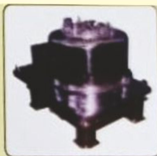
48" O FOUR POINT GMP CENTRIFUGE