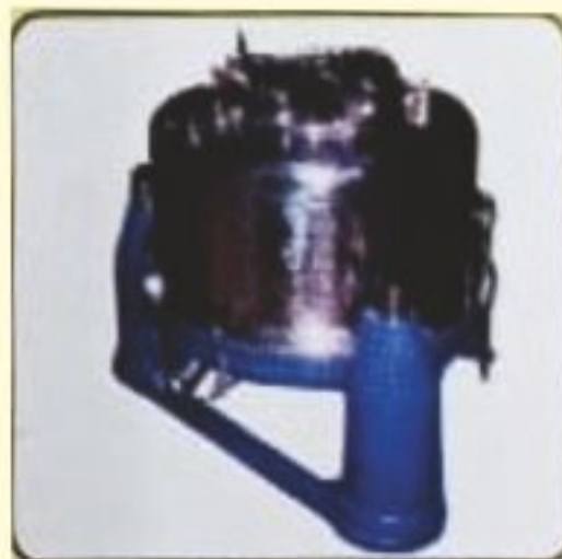
3PT STD MANUAL TOP DISCHARGE TYPE CENTRIFUGE