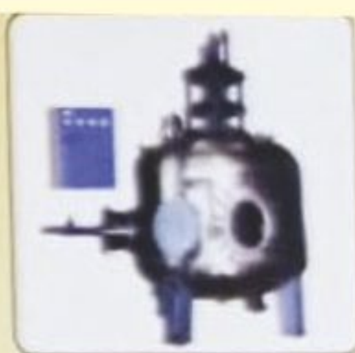
AGITATED NUTSCHE FILTER